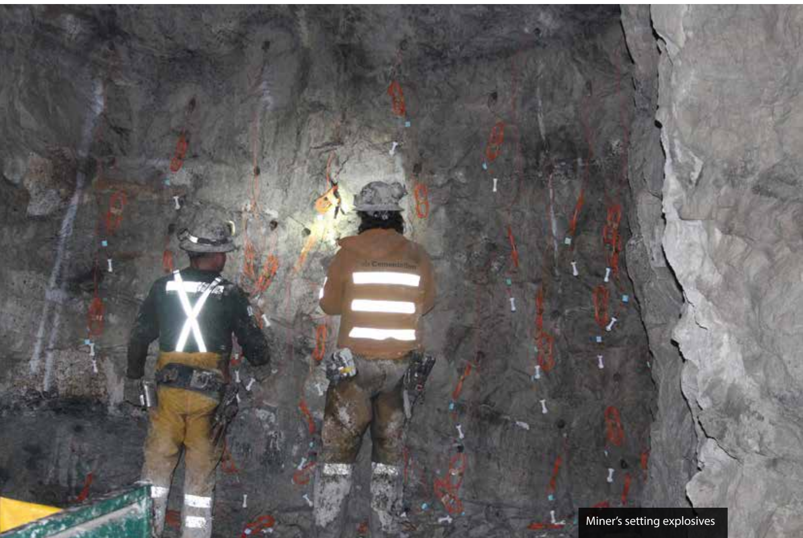
Miner's setting explosives

Glasier picked out the Biden administration's onshoring strategy as having particular significance in boosting uranium's fortunes.